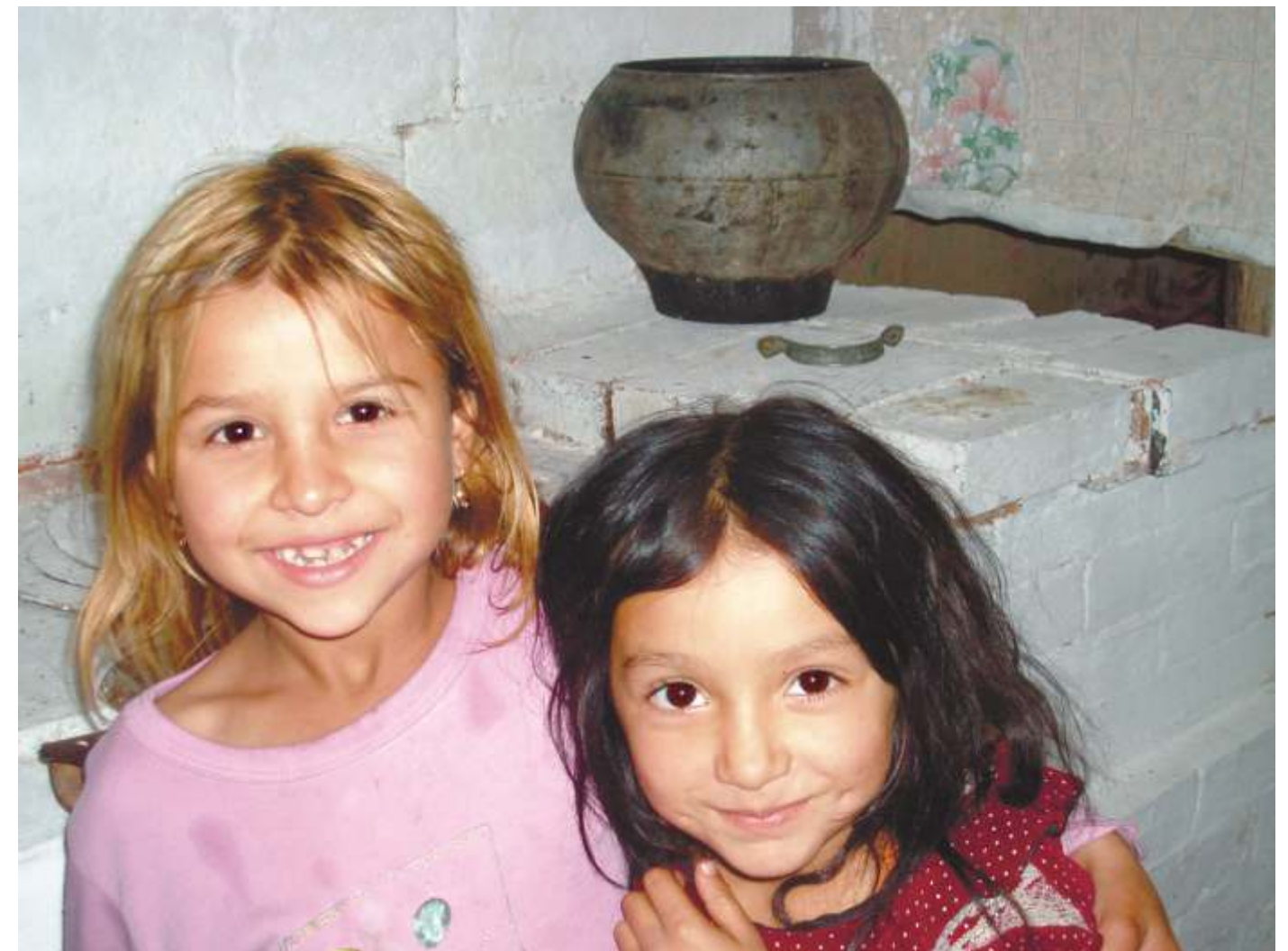
Roma children: "Down and out of school"

Open Society Institute http://www.ccfcd.asso.fr