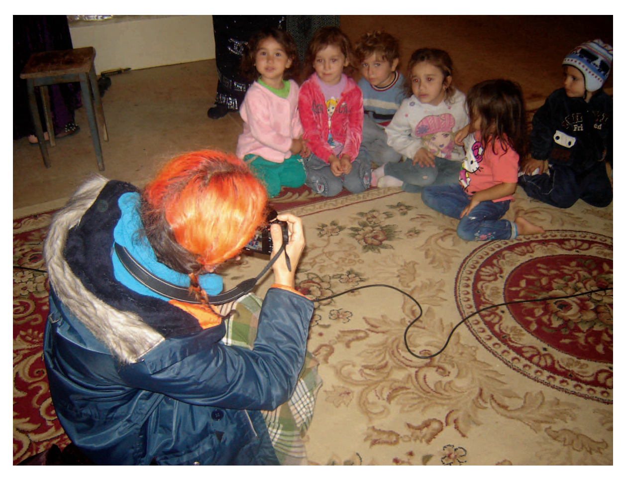
ADC\ ``Memorial" observer\ takes\ photos\ of\ Roma\ refugees\ from\ Donetsk\ in\ Rostov\ Oblast,\ Russia.