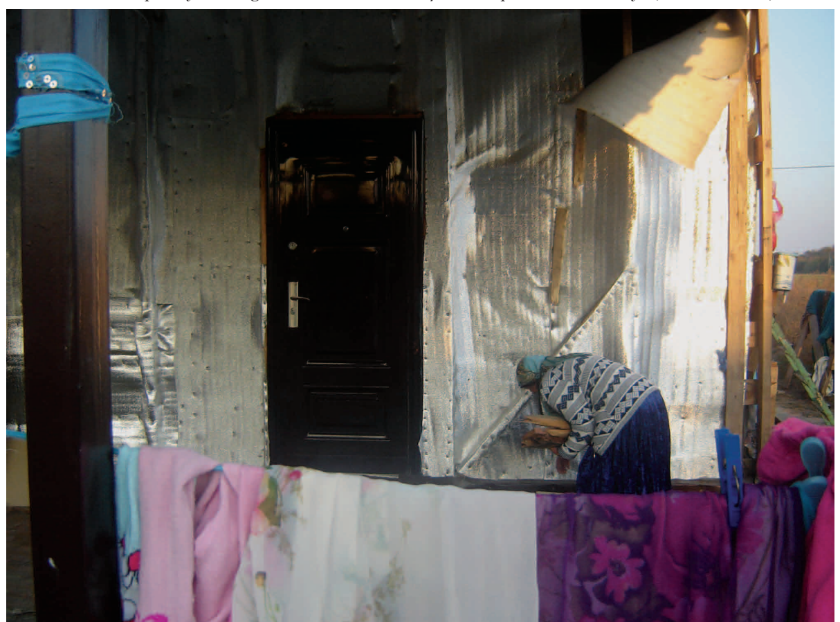
Temporary housing with insulation made from scrap materials. Bataysk, Rostov Oblast, Russia.

It is very hard for Romani men, who are the main breadwinners in the family, to work in these new conditions. The traditional occupations of Kotlyar Roma—metalworking, reselling metal, and collecting and selling scrap metal—are not very profitable in these new locations. Men cannot officially accept a